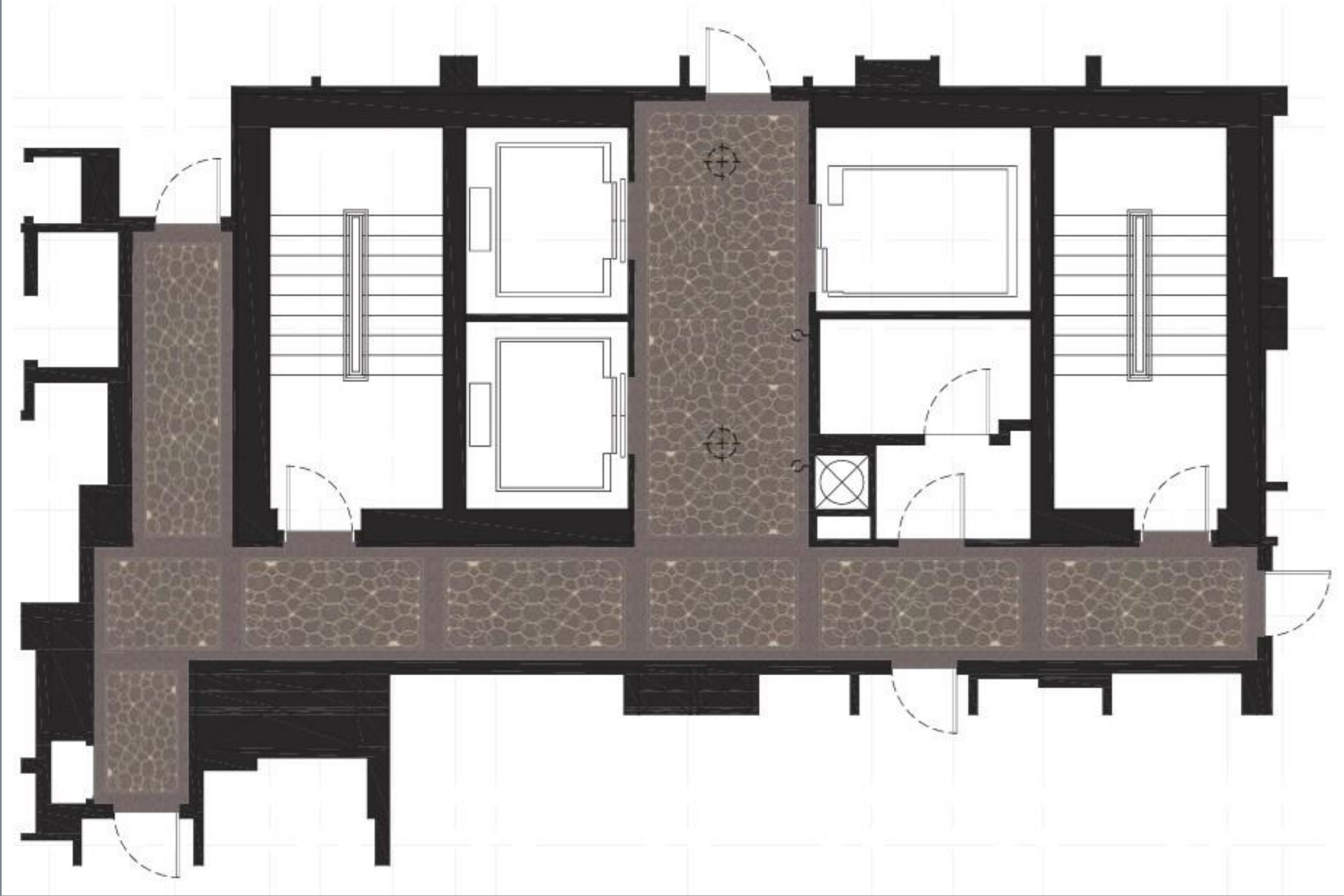
FLOORPLAN OF CARPET LAYOUT